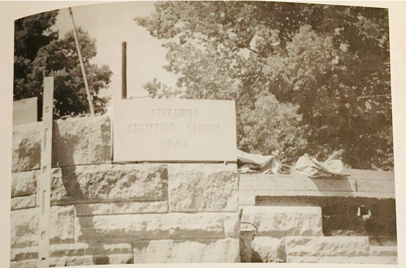
1948 – Laying the Cornerstone

The congregation quickly grew with a huge boom during WWII. By September of 1945 the church was well over 900 members. Sunday School overflow classes were meeting in the elementary school across the street. There were two services every Sunday. It was time to add on! In early 1948 the drawings were prepared. There was to be a larger sanctuary built, a social room, junior chapel, classrooms for primary to high school and a dedicated nursery. The new corner stone was laid on July 18, 1948. The dedication of the new Sanctuary was on September 11, 1949. By May of 1956 the education wing was completed. The new facility held 1,000 people. There was and estimated 1,400 attending at this time with 1,900 members. Over 200 men attended fellowship dinners and the CWF was comprised of 10 circles.