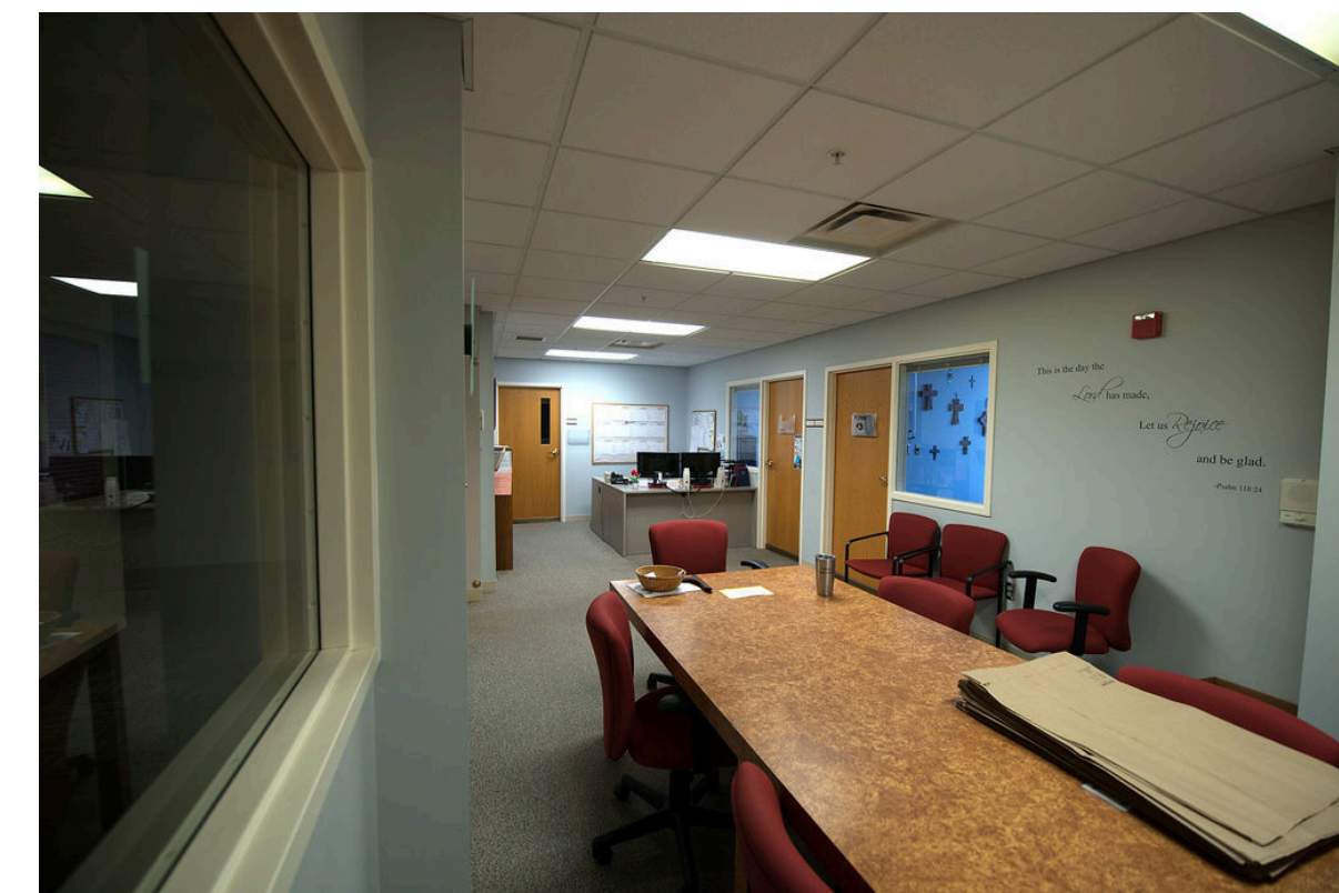
Offices & Meeting area