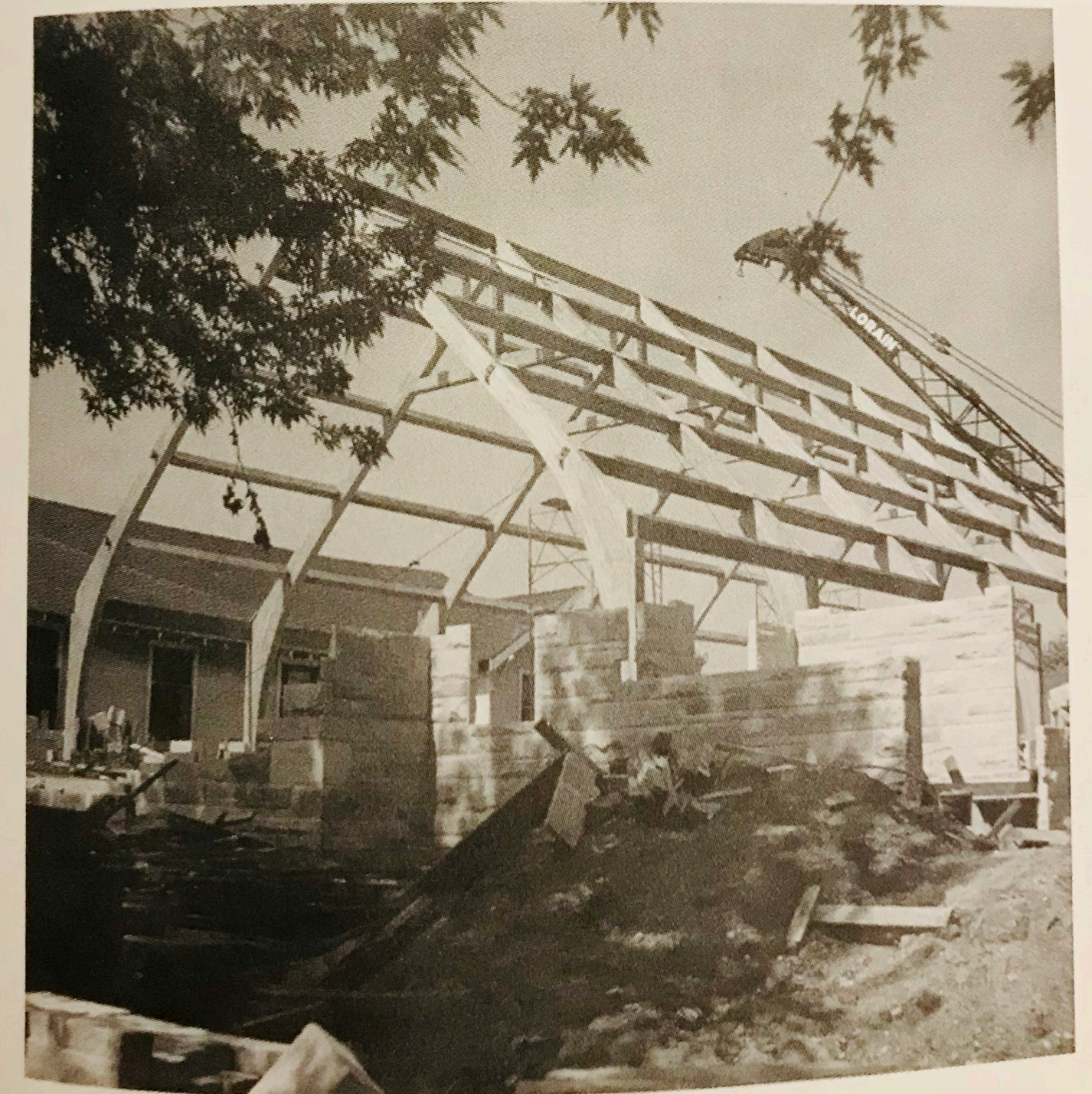
Sanctuary Construction – 1948