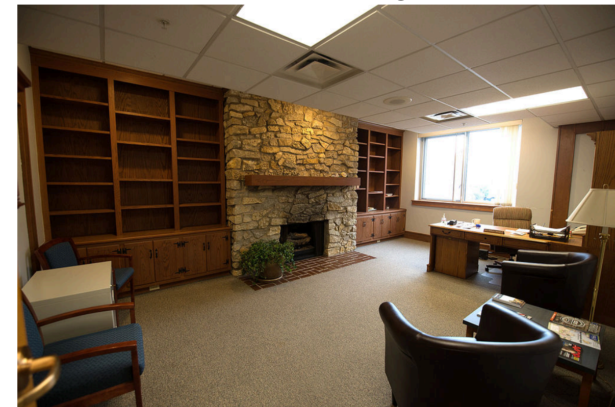
Senior Minister's Office