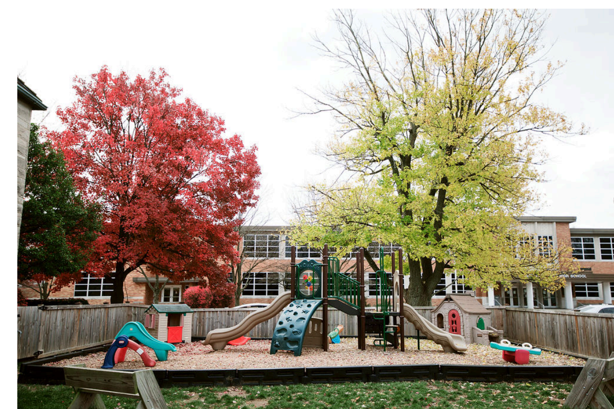
Outdoor Gathering Area