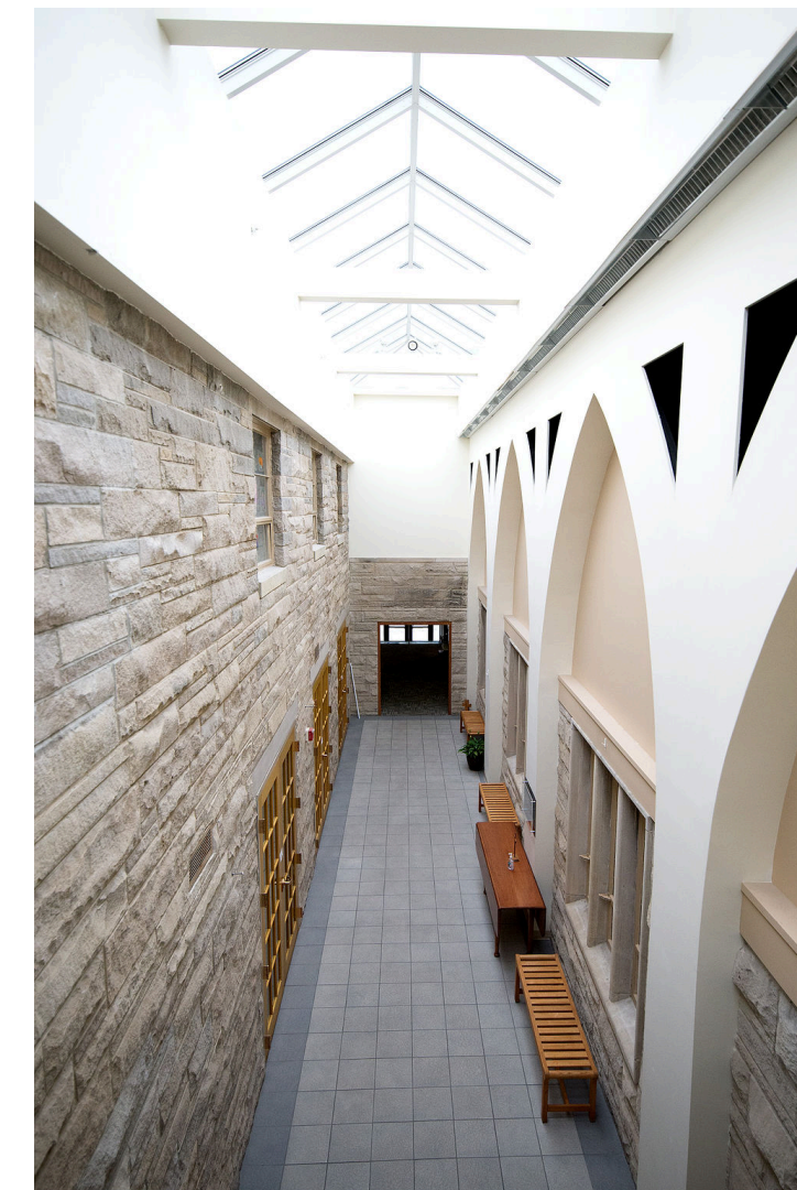
Hall of Lights

A while after the renovation finished, SCC bought the property next door. With the help of Opportunity Day Preschool we turned this into an outdoor gathering area.